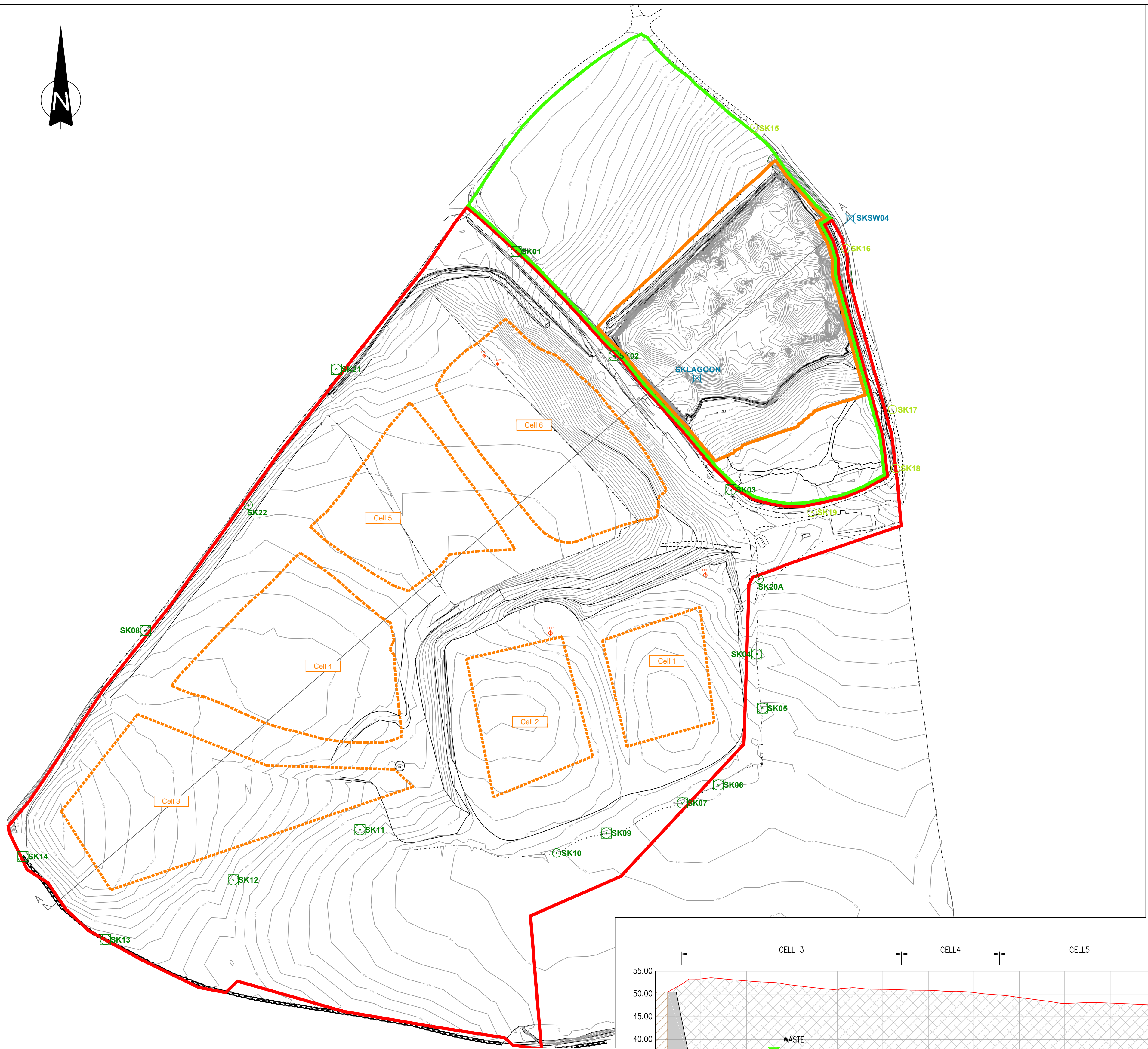
PLAN SHOWING SECTION LOCATION SCALE 1:2000