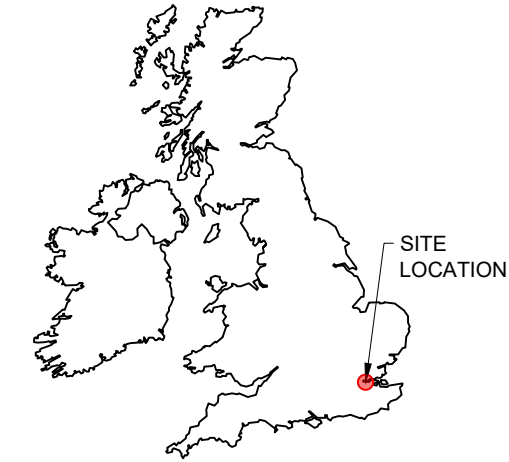
KEY PLAN - NOT TO SCALE