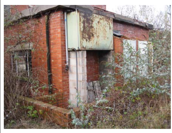
Photograph 4. Above Ground tank near to transformer compound