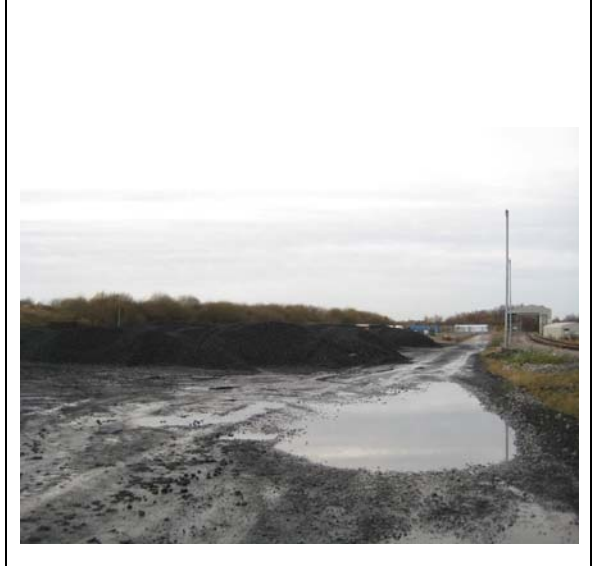
Photograph 7. Current coke store on hardstanding