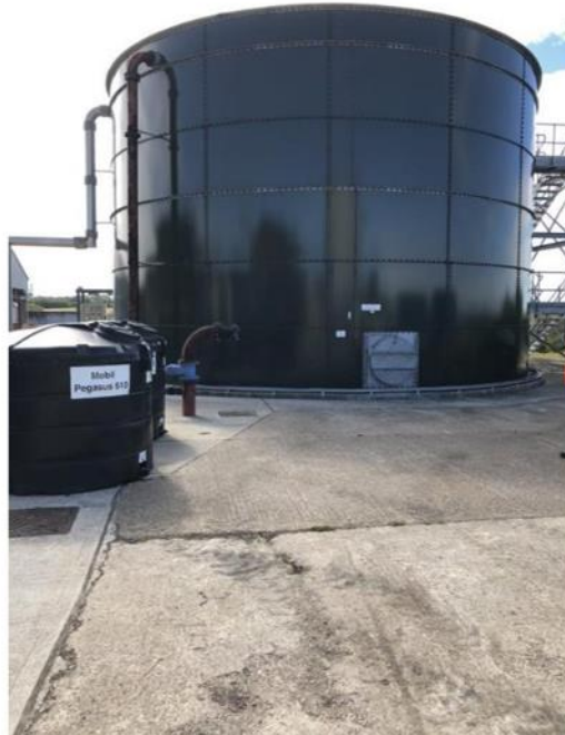
Photo showing the Cake Pad.

The digested sludge is received at the Secondary Digester Tank prior to transfer to the Digested Sludge Buffer Tank and then for dewatering.