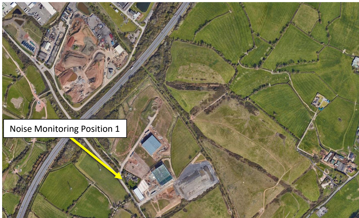
Figure 4.1 - Site location and noise monitoring position