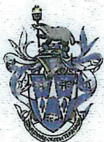
CIWM Chief Executive Officer

The Chartered Institution of Wastes Management