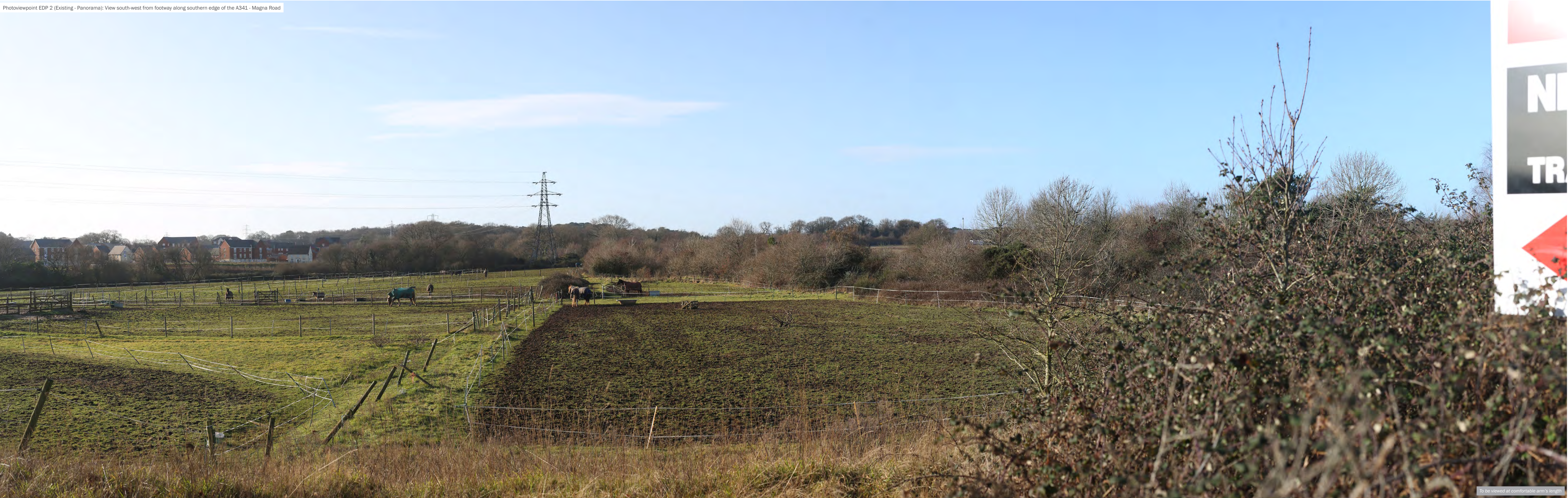
Photoviewpoint EDP 2 (Existing - Panorama): View south-west from footway along southern edge of the A341 - Magna Road

To be viewed at comfortable arm's length