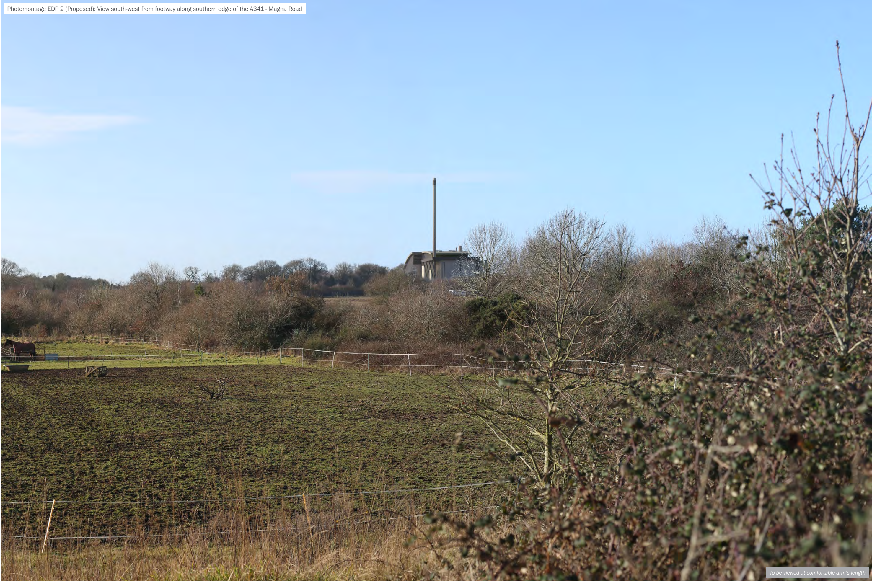
Photomontage EDP 2 (Proposed): View south-west from footway along southern edge of the A341 - Magna Road

To be viewed at comfortable arm's length