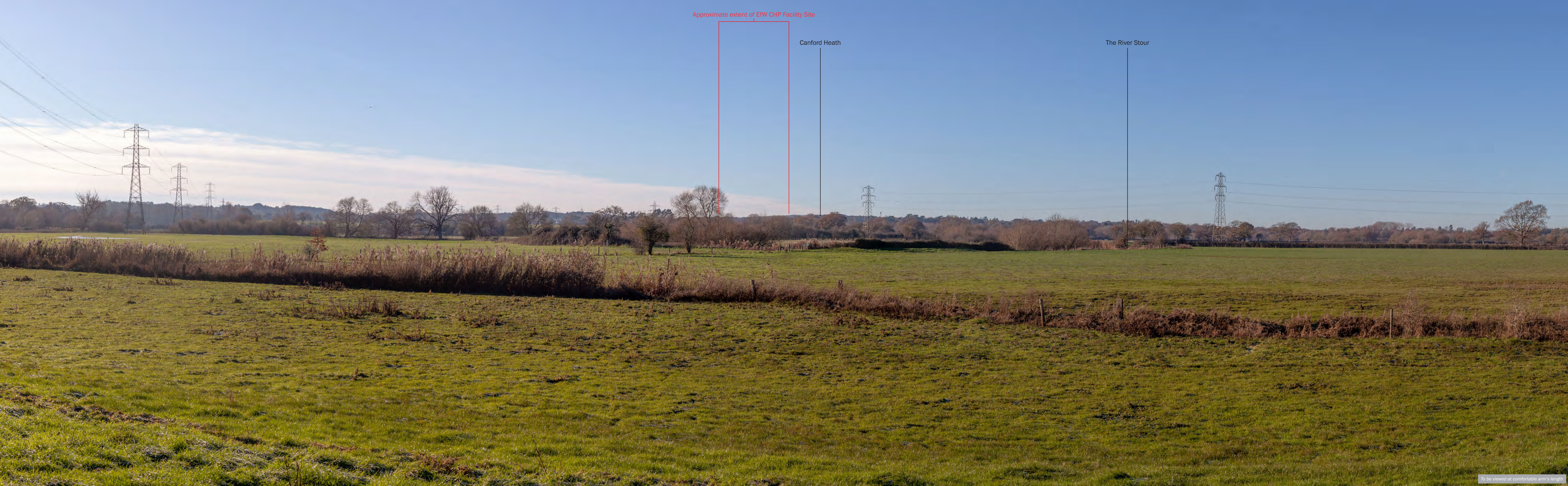
Photoviewpoint EDP 7: View south-west from Footpath 2 adjacent to the River Stour

To be viewed at comfortable arm's length