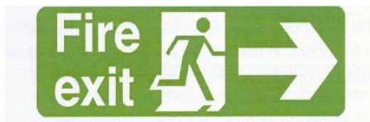
Figure 1. Fire exit sign

In order to comply the signs must be in pictogram form and can be supplemented by text to make the sign more easily understood (Fig. 1).