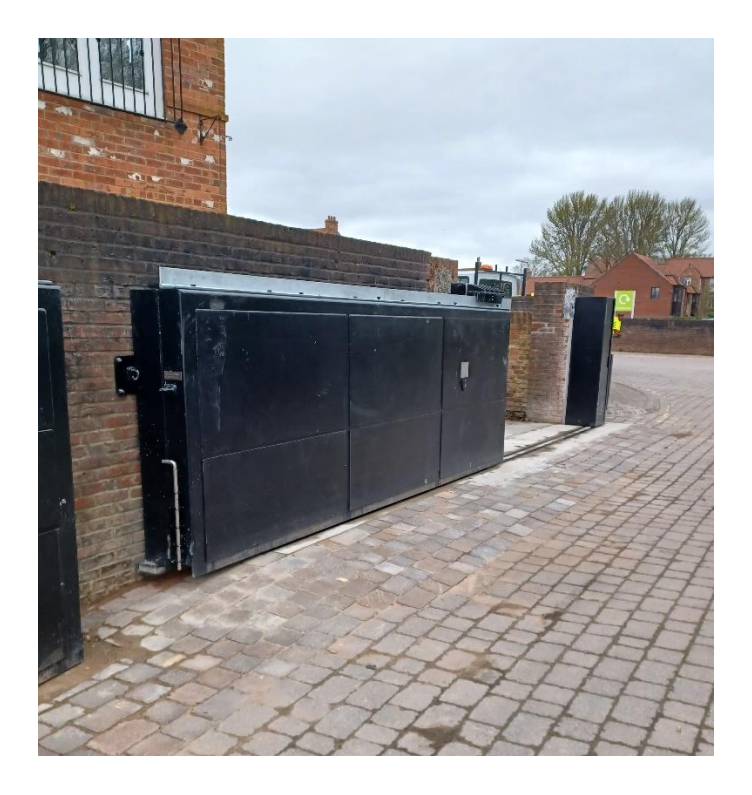
Figure 2. New sliding Gate 27 Installed and Tested

Work to upgrade Gates 31 and 32 commenced in late March 2024 , with a footpath closure shown below to maintain safe segregation of the workforce and the public. During this period some temporary traffic lights will need to be in place to maintain a safe flow of traffic past the work area at gate 31. The first operation in this area will be a soil sample rig to carry out some ground investigation works in the area.