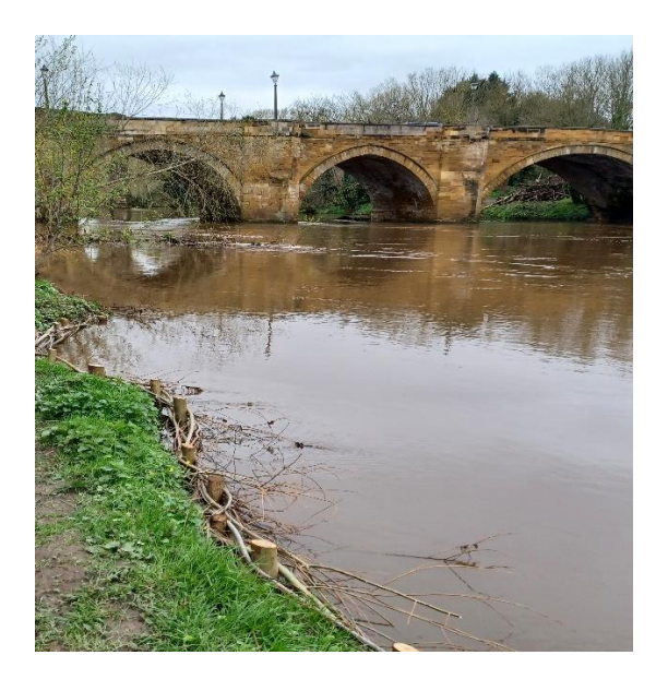
Figure 4. Environmental Enhancements on the River Tees.

The environmental enhancement proposals are natural, will create habitat, improve ecology and will rehabilitate around 50m of riverbank, increasing the resilience of sections of bank along the True Lovers Walk. Works by the Tees River Trust will continue in other locations over the coming weeks, with small sections of True Lovers Walk being closed to public access.