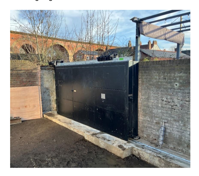
Figure 1. New sliding Gate 17 Installed

Construction on the Yarm Flood Alleviation Scheme continues with Gate 17 having now been successfully installed and tested. The safe working access platform is to be installed and the reinstatment is ongoing.