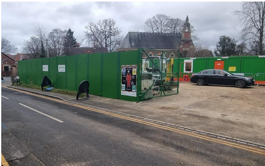
Figure 1. Site Compound installed

Whilst the project is ongoing, We need to have clear access to the compound at all times therefore parking is not allowed in the entranceway or beside the compound.. During the construction period, there will be some construction traffic around Yarm, although we will ensure this is kept to a minimum.