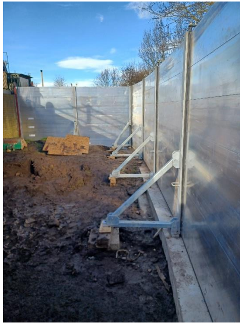
Figure 2. Temporary Defences in place at Gate 17.

No access onto True Lovers Walk through the Gate 17 opening will be possible during the works, until mid to early March 2024 , with footpath signage installed warning of closures.