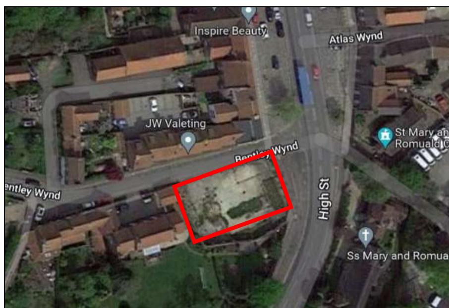
Figure 1. Site compound location

The Yarm Flood Alleviation Scheme has commenced, with works to install the compound area on Bentley Wynd, now well under way. The compound location is highlighted on the map below in Figure 1.