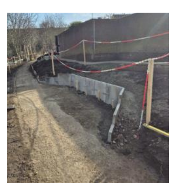
Figure 2. New passing places installed on True Lovers Walk – tarmac to be laid.