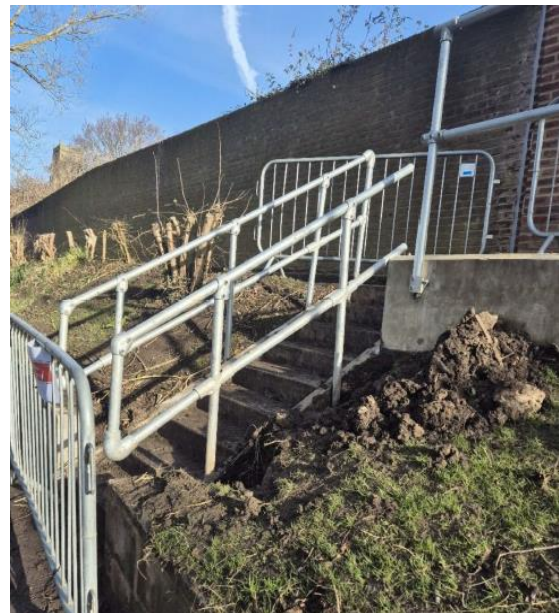
Figure 2. Handrails being installed on Gate 3, off True Lovers Walk (with temporary fencing also pictured)