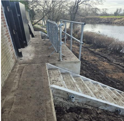
Figure 3. New access platforms, Steps and Handrails being installed off True Lovers Walk

Whilst we understand that this could be inconvenient to walkers in the short term, this closure is necessary to facilitate access needs and means that we can safely deliver the scheme. We want to reassure residents that we are doing everything possible to re-open the remaining sections of footpath as soon as we can. We apologise for any inconvenience our activities may cause and thank you for your continued patience and cooperation.