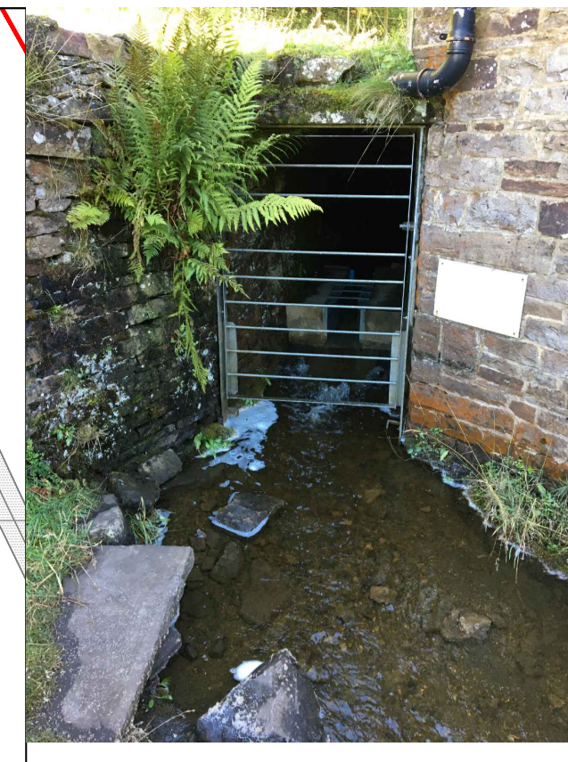
PHOTOGRAPH 2 - RAMPGILL ADIT