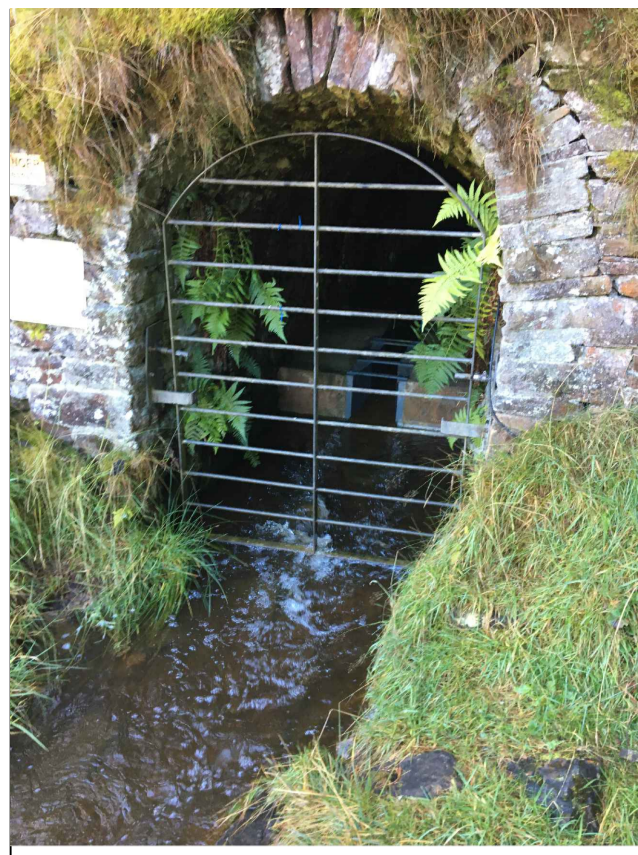
PHOTOGRAPH 1 - CAPLECLEUGH ADIT