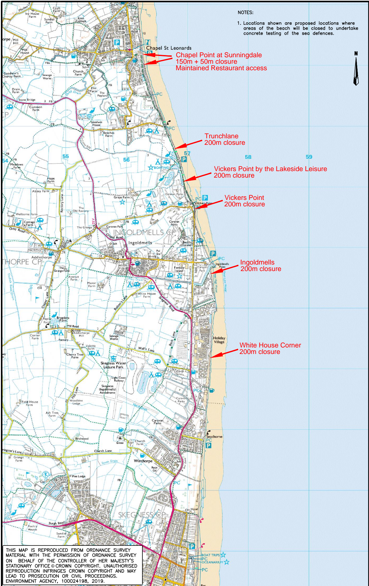
Chapel St Leonards to Skegness