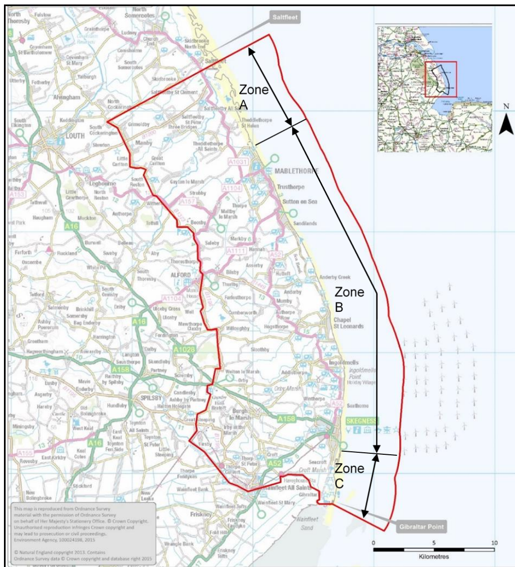
Figure 1: The strategy area

The strategy area extends up to 15 kilometres (km) inland and over 37 km along the coast, from Saltfleet in the north to Gibraltar Point in the south, as shown on Figure 1. To help develop the strategy, we have divided the coast into three zones (A, B and C) based on the actions taken to manage flood risk along the coast in recent decades.