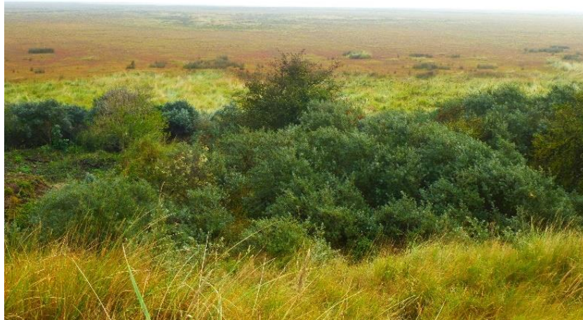
Photograph 1: Saltfleetby – Theddlethorpe Dunes (Zone A)