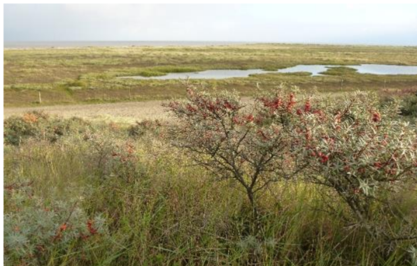
Photograph 3: Gibraltar Point (Zone C)