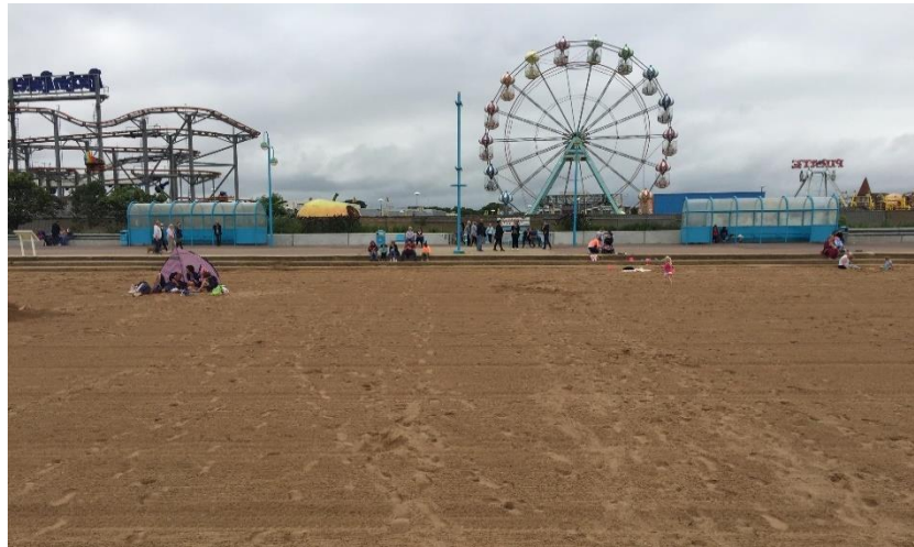
Photograph 2: Skegness – North Bracing beach, promenade and flood wall (Zone B)