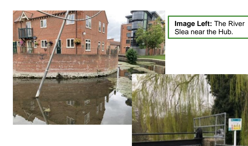
Image right: Cogglesford Sluice tilting gate one of many moveable structures on the Slea. It is used to retain water levels within the River Slea and allows water to pass when water levels are high to reduce flood risk.

Not yet on our mailing list? Just send us an email with your name, email address and interest in the Slea.