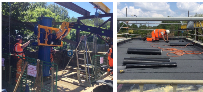
The control panel building roof has been replaced

Over the last few months, works have taken place within the pumping station, replacing valves, pumps, and equipment, with a new control panel being installed too. The control panel building roof has been replaced and the permeable paving continues to be laid around the compound area as work progresses.