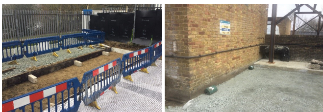
Figure 1 Permeable paving works continue around the pumping station