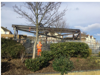
Gantry crane steelwork installed (view from the lake side of the pump station)