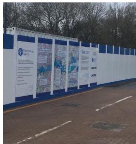
The compound and welfare area, picture taken from Ridge Close.

We have erected a gantry 'A' frame over the pump chamber. The 'A' frame will allow us to lift and replace the old pumps and pipes with new ones.