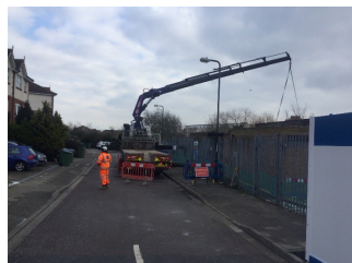
Installation of gantry crane steelwork with Hiab, from Ridge Close