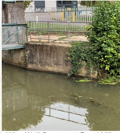
Wing Wall Damage at Royal Mills