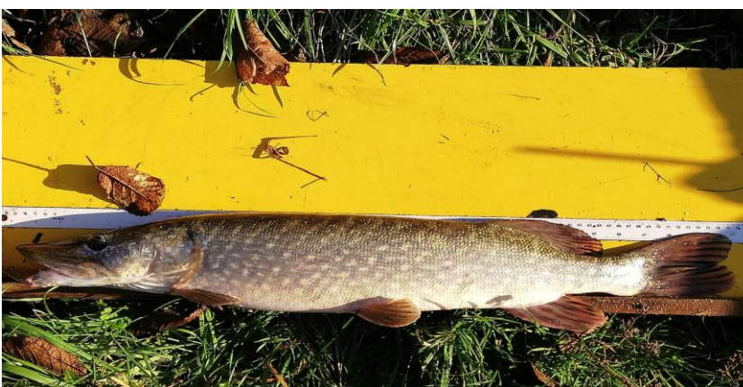
Adult pike caught during electric fishing of marginal areas