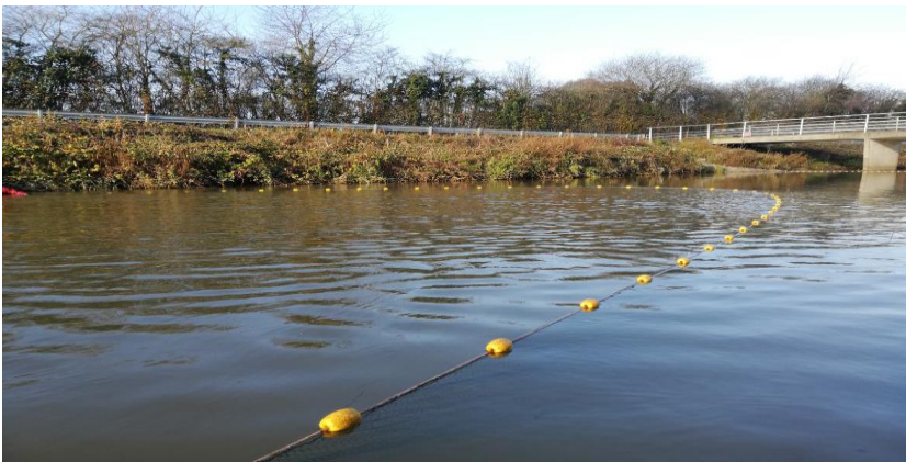
Seine net placed in the River Ember as part of the fish survey

The current arrangement of sluices and water level management structures within our study area restrict the free movement of migratory and coarse fish species through the catchment. Eel passes fixed to main sluice structures have helped eels move upstream, however Viaduct Sluice is still poses a barrier for fish and eels to move further up into the River Mole catchment