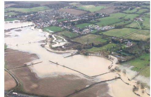
Above: Ariel photograph of the River Roding flooding in December 2019, taken by a local resident