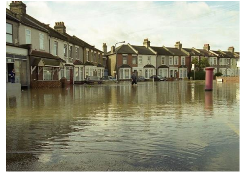
Above: Photo of flooding in Woodford following flooding from the River Roding in 2000

Below we have also provided an outline of the works we expect to complete up to July 2024. Future project updates will be provided on our information page.