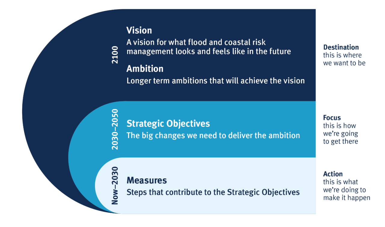
Figure 3.1 The timescales and elements that make up the draft strategy

In contrast, the measures indicate what action will be taken to reach a desired end point. It is therefore the measures that will influence FCERM activity, such as subsequent levels of guidance, plans and schemes, to potentially affect European sites. We have therefore screened each of the measures.