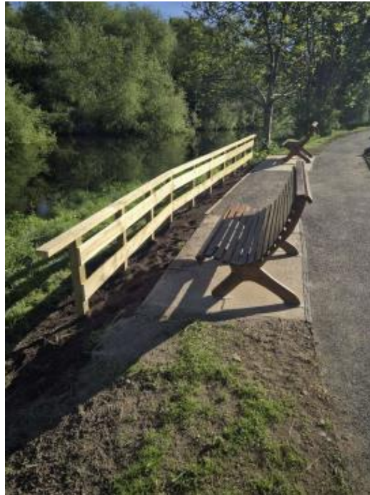
Figure 4. Reinstatement of Seating Area, along True Lovers Walk.