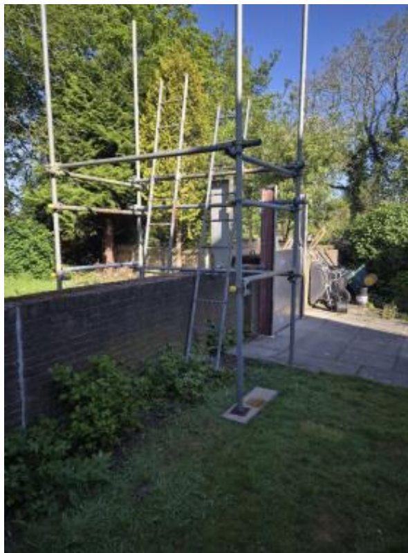
Figure 1. Final Gate Installation.

The final phase of the Flood Gate Replacement works is nearing completion, with all flood gates now installed. We will continue to undertake the necessary re-instatement to ensure that the working areas are returned back to their pre-condition. We would like to thank everyone affected for their patience and support, whilst we've been undertaking these vital works to manage flood risk to Yarm.