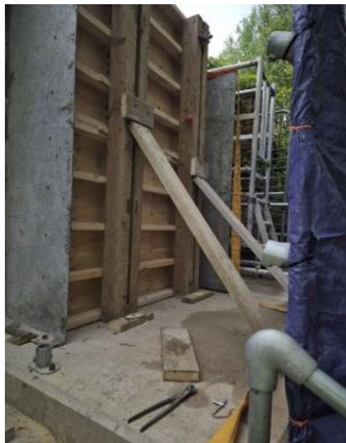
Figure 2. Re Test Shutter and Safety Screen in place.

In addition to the above water testing, following our quality checks, some of the hydraulic pumps used to raise and lower the gates need to be replaced with a new, improved pump. The gates remain fully operational and continue to be checked regularly. Our contractors will be in touch with any residents or landowners should access to their property be required to replace these pumps, over the next couple of months. The flood gates remain fully operational in the meantime.