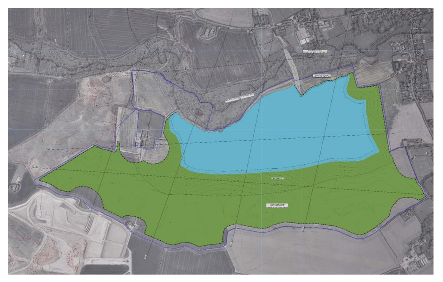
Map showing the extension to the river's flood plain or "off-line" flood storage area (edged in blue) to be formed through Blackwater Aggregates' restoration operations across the site. The dam (or embankment) location near the football ground is shown as the light grey strip crossing the valley