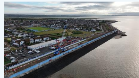
Main compound, looking at completed section of revetment