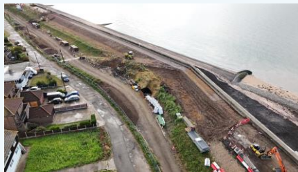
Work at Chapman Sands