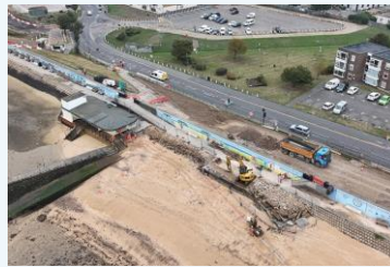
Work on Concord Café phase