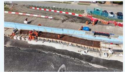
Chapman Sands ramp reinforcement being installed