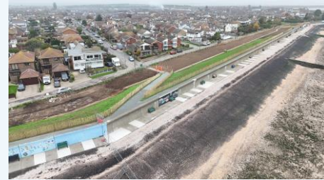
Reinstated area on the landside to Marine Parade is now open