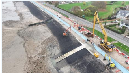
Precast steps at Eastern Esplanade