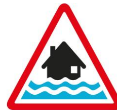
Flooding of homes/businesses is possible