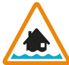
Prepare for flooding

There are three levels of flood warning: