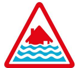
Deep fast flowing water Risk to life

Sign up online @ www.gov.uk/flood Or by phoning Floodline : 0345 988 1188 Or textphone: 0345 602 6340