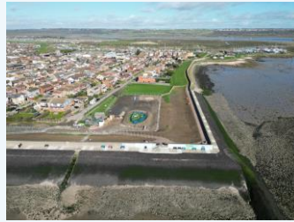
Footpath at Leigh Beck