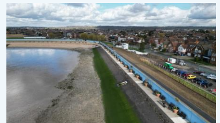
Footpath at Thorney Bay