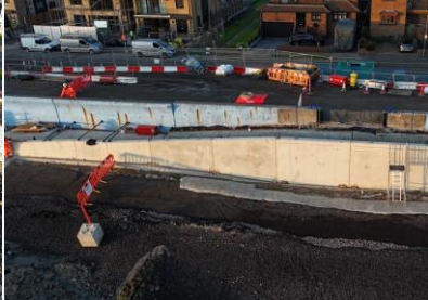
Steel sheet pile wall - Concord Beach