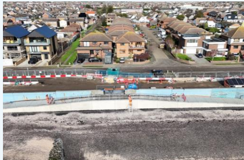
Chapman Sands ramp construction