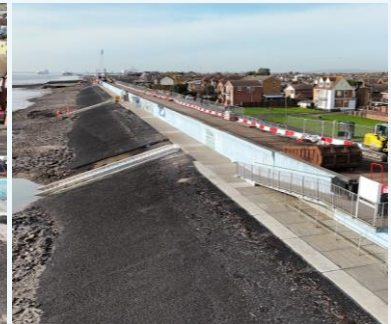
Revetment and new step looking west along the shoreline