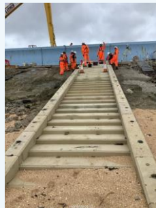
Thorney Bay steps installation