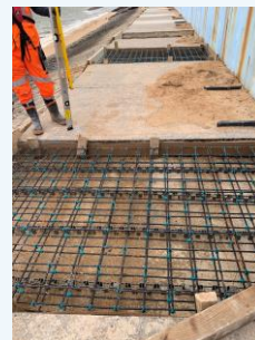
Maintenance access slab replacement at Fisherman's Corner