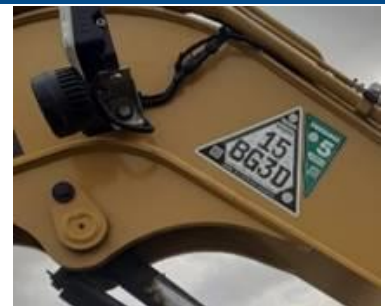
Low emissions machinery

Machinery used on site at Canvey is compliant with the 'EU IV' and 'EU V' standards. These standards regulate vehicle emissions and their impact on the environment.