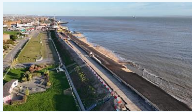
Placement of OSA/LSA on the foreshore in the Labworth Café area