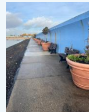
Memorial benches returned to Thorney Bay