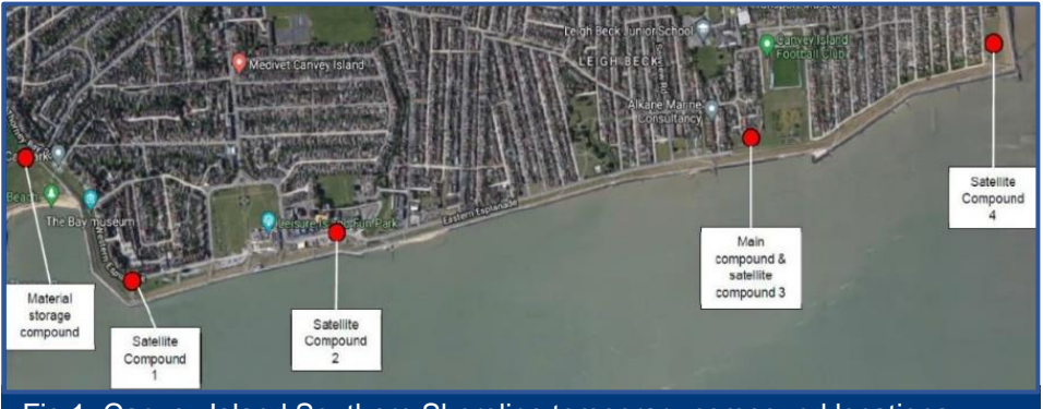
Fig 1: Canvey Island Southern Shoreline temporary compound locations

To find out more about the planned area of works and timeline, please see Fig 3 on the next page.