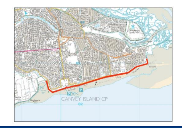
Fig 2: The red line indicates the area of revetment we will be working

Fig 1: Canvey Island Southern Shoreline temporary compound locations