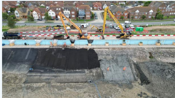
Drone image of the work at Thorney Bay.