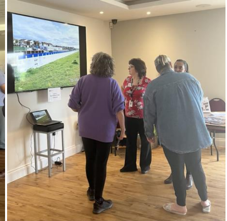
Visitors and staff at the drop-in