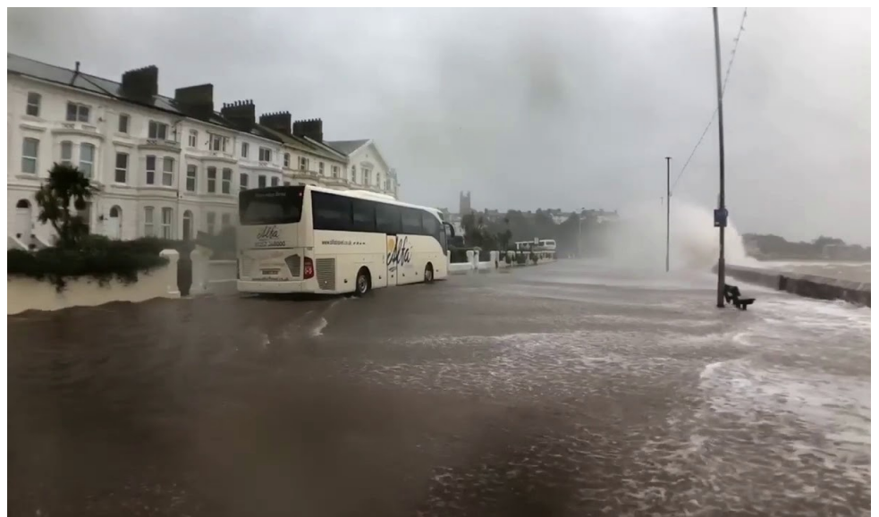
October 2018—Storm Callum flooding along the Esplanade