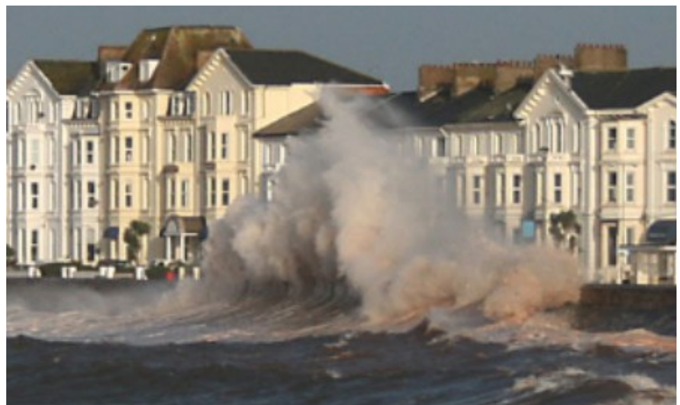
Storm surges increase the risk of tidal flooding along the Esplanade

We will be holding a public event for the Alexandra Terrace Junction before the detailed planning application is submitted. We will let you have the date, time and venue for this as soon as we can.