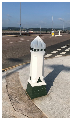
Exmouth's historic traffic bollards have now been repainted and restored to their original position