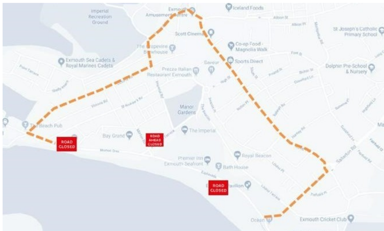
Image 1: location of Exmouth Tidal Defence Scheme Flood Gates that close the highway when flooding is expected

15 of the 27 flood gates will be operated by community volunteers. Community-closed gates can offer more flexibility for gates to be opened between tides, and also sooner once the all clear is given. Thank you for being an integral part of Exmouth Tidal Defence Scheme!