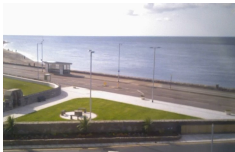
The new junction at Alexandra Terrace

The junction where Alexandra Terrace meets The Esplanade has been redesigned as a key part of the Exmouth Tidal Defence Scheme. As well as providing benefits to reduce flooding it has also improved road safety by simplifying the junction with improved traffic management.