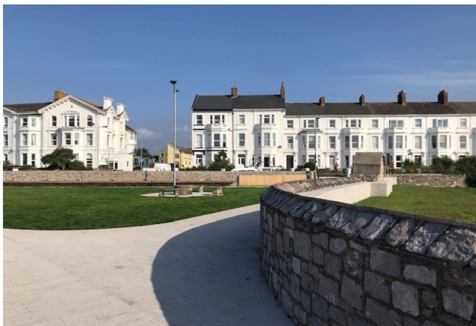
Reinstatement of Alexandra Terrace Junction

The Exmouth in Bloom planting team have worked their magic on this eye-catching bed at Alexandra Terrace. The plants have been specifically selected for their drought and salt tolerant properties and the beautiful new stone clad wall makes a perfect backdrop.