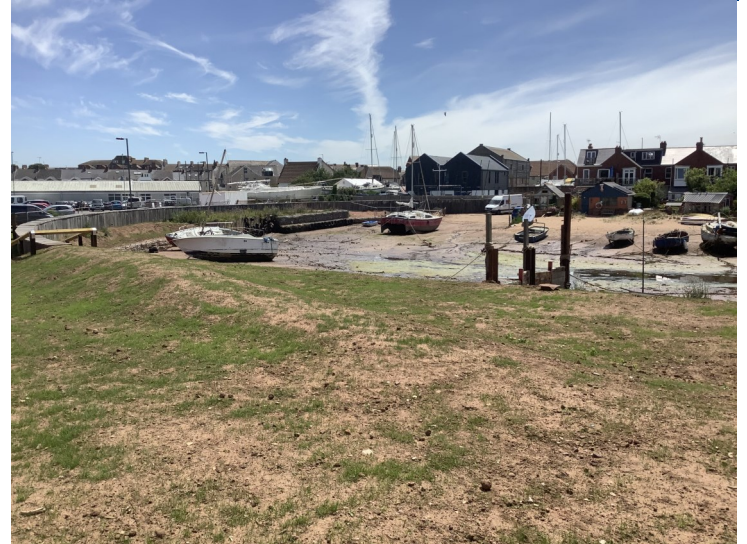
New earth embankment & timber clad steel pile defences