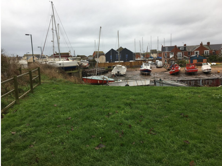
Camperdown Creek looking south-east