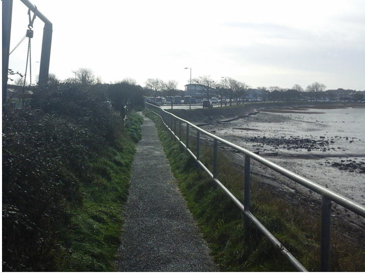
Estuary Trail (East Devon Way) looking south