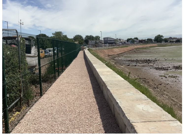
New defence wall, footpath and revetment repairs