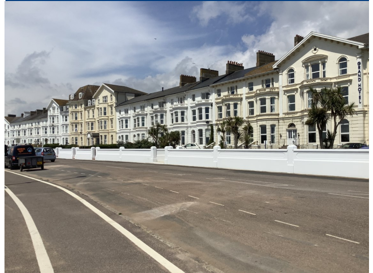
New defence wall along front of Morton Crescent