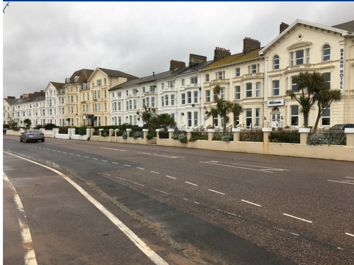
The Esplanade / Morton Crescent looking west