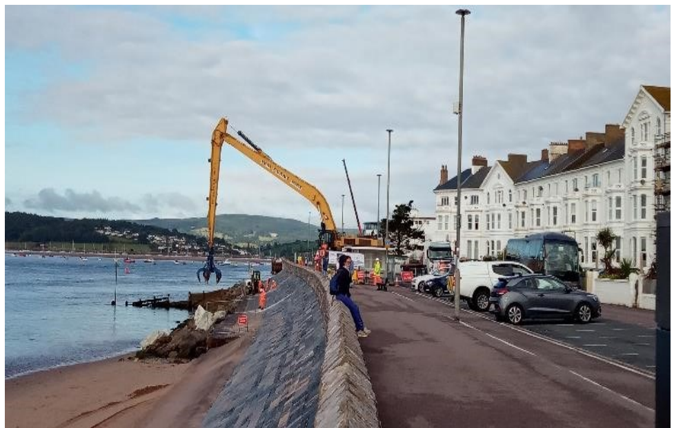
Topping up of rock armour—Esplanade Exmouth

All businesses will be open during the works, however car parking along The Esplanade will be reduced.